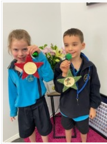
Creativity at Wet Weather Play